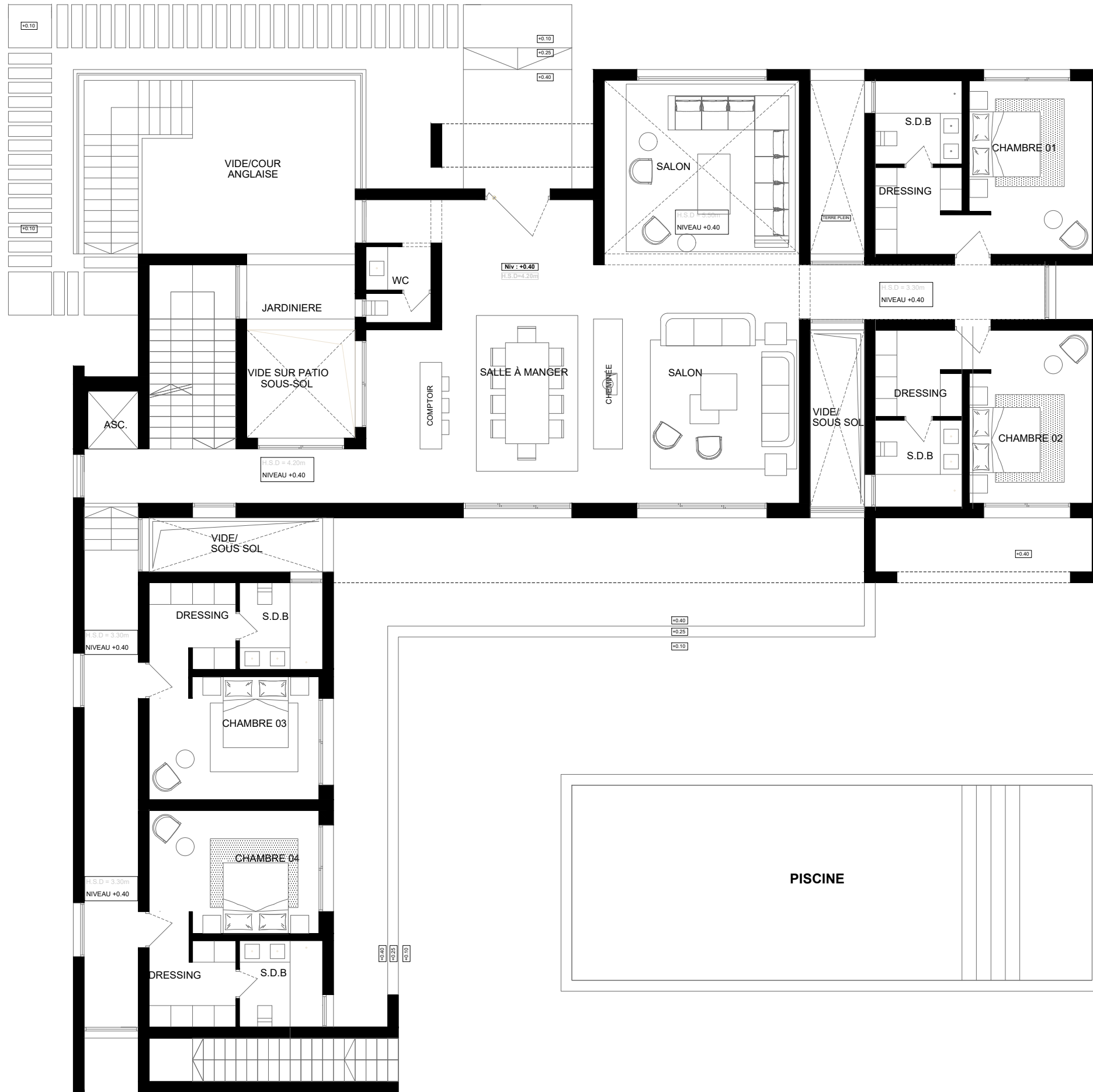
01 — PLAN RDC