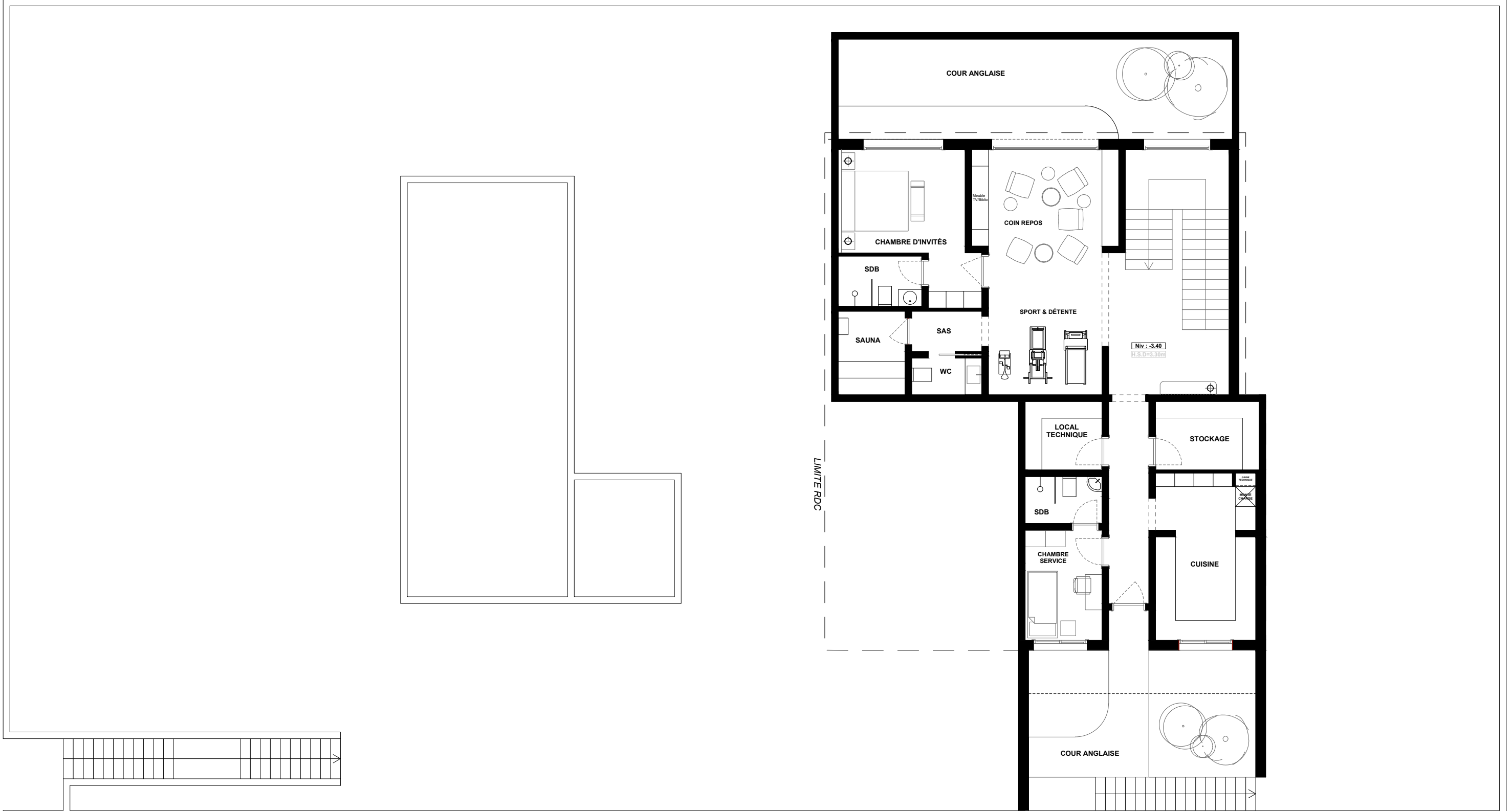
03 — PLAN SOUS SOL